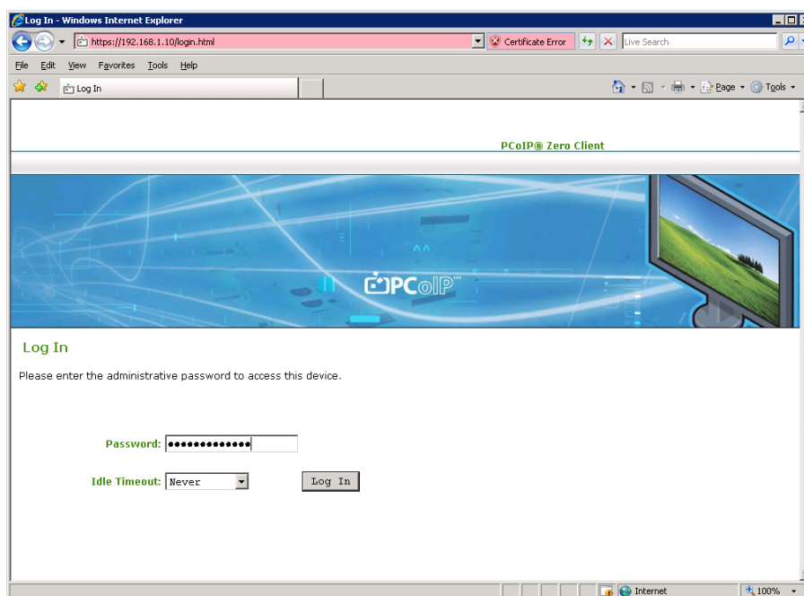
Figure 1 - Login as Administrator