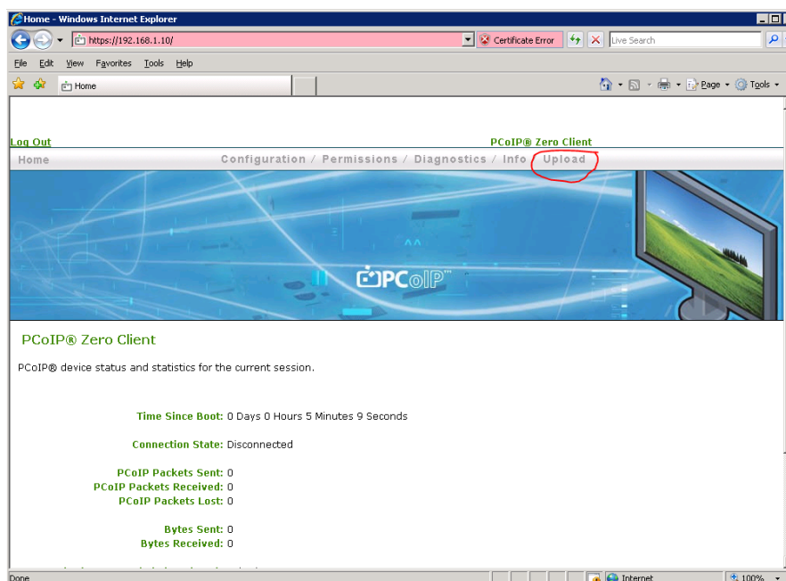
Figure 2 - Uploading the Firmware File